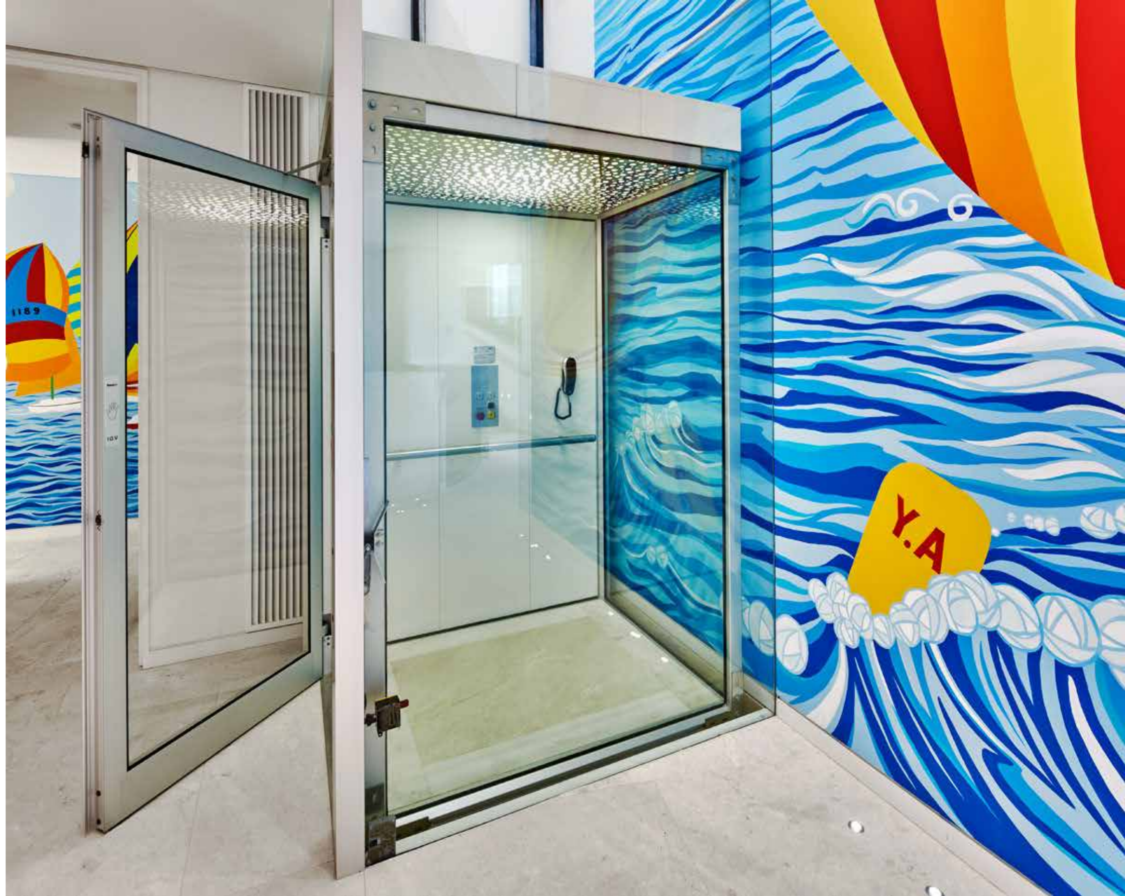
'Vaucluse Residence'

Easy Living Home Elevators teamed with one of our valued customers and have once again pushed the boundaries with creativity and uniqueness! The two storey residence showcases our Australian icon, the 'Domus Advantage Lift' with the lift car measuring 1100mm wide x 1400mm in depth, contained in a sleek, sophisticated, custom designed glass tower, positioned in front of a dramatic, eye catching and ever so quirky mural.