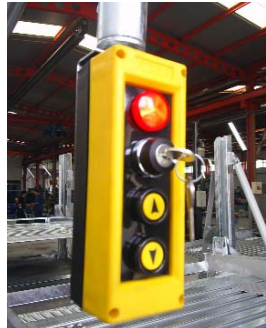
OPTI-LIFT and MAJOR-LIFT. Removable key control panel. Requires a turn of the key to operate.