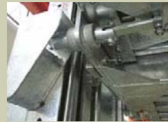
MAJOR-LIFT Mechanical safety lock