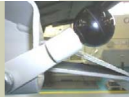
OPTI-LIFT Mechanical safety lock release handle